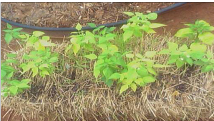
Figure 5. Nitrogen deficiency in pepper.

Adequate nutrient supply is critical for plants growing in bales. Make sure that plants have a sufficient supply of the major nutrients nitrogen, phosphorus, and potassium throughout the season. Nitrogen deficiency is very common in straw bale beds because the microbes are using much of the available nitrogen to break down the bale, and nutrients are lost from leaching. If the oldest leaves begin to turn yellow before their physiological maturity, this is an indication that nitrogen may be limiting (Figure 5). Purpling is a symptom of phosphorus deficiency, while leaf margin necrosis (brown leaf edges) is a symptom of potassium deficiency.