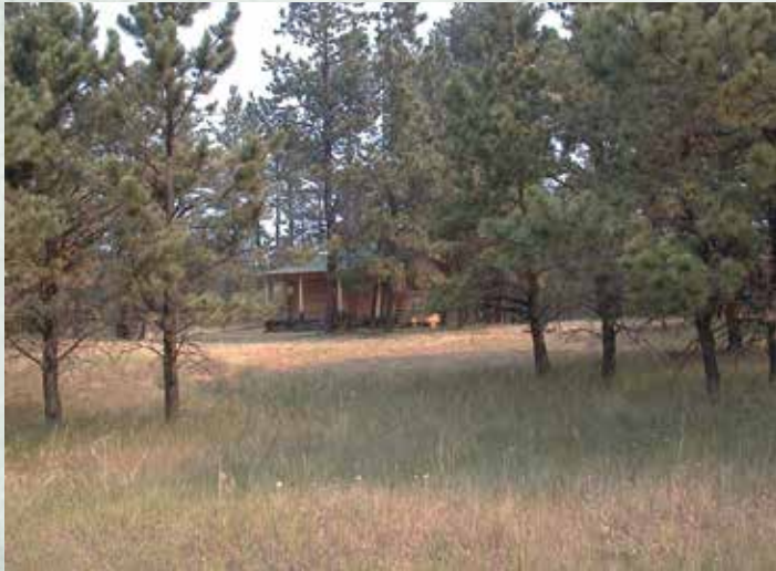
This cabin appears at first glance to not have any problems but look closely at how thick and dense the forest is, how tall the brown grass is, and the firewood pile under and near the deck. See the photo to the right after the wildfire arrived.

In addition to the right plants, hardscaping can help protect a home. Rock mulch is a very useful addition to landscapes where wildfire is a concern. Using pea-sized gravel mulches and/or larger rocks up to boulder-sized can be an attractive form of hardscaping that will not burn or carry flames to the home. Other forms of hardscaping to create firebreaks around a house include paved patio areas, walkways and driveways of gravel, concrete or pavers, and raised beds made of rock or brick.