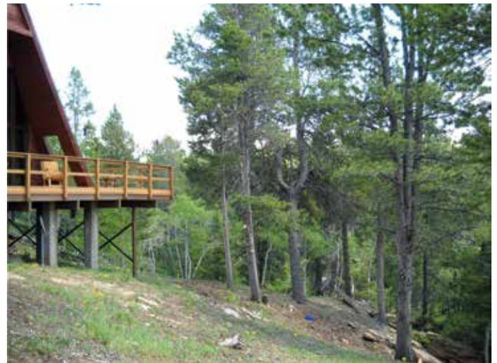
This cabin owner followed up a year after the treatment with a native wildflower mix on the bare soil.

zone beneath the needles where the needles have begun to decompose. Remove all pine needles under decks and within 2 feet of any structure. Move firewood piles away from the structure during fire season.