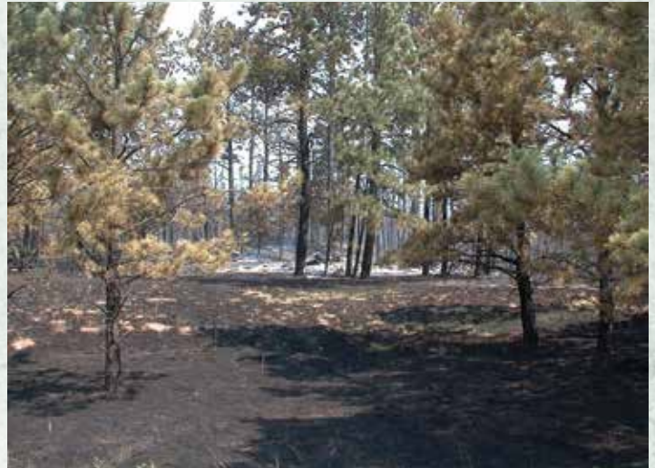
Firefighters were unable to reach this home before embers entered the firewood pile and the cabin, which caused the cabin to become fully involved with fire. Wildland firefighters are often not equipped to handle structure fires once a house is fully involved with fire.