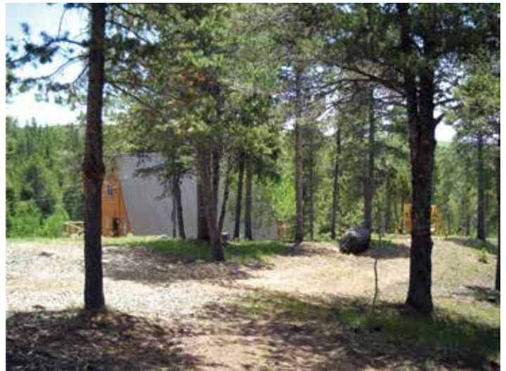
This mountain cabin owner thinned and pruned up the trees and removed a significant amount of under-brush. Limbs and whole trees have been chipped.

Dead vegetation includes dead trees and shrubs, dead branches lying on the ground or still attached to plants, dried grass and flowers, dropped leaves and needles, and firewood. Dead vegetation should be removed from the defensible space area. Two important exceptions are pine needles covering bare soil and downed trees embedded in the ground. Pine needles are good cover for bare soil but should be kept to a thickness of between 1 and 2 inches – more is a hazard and less promotes erosion. Be careful not to remove the duff area – the dark brown