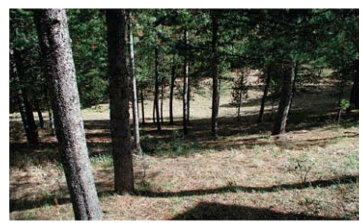
Lodgepole pine before (left) and after thinning to create defensible spaces. Many homeowners report an increase in aesthetic appeal.

propane and other flammable liquids should be at least 30 feet from the structure.